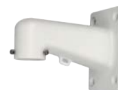
DH-PFB305W Wall Mount Bracket